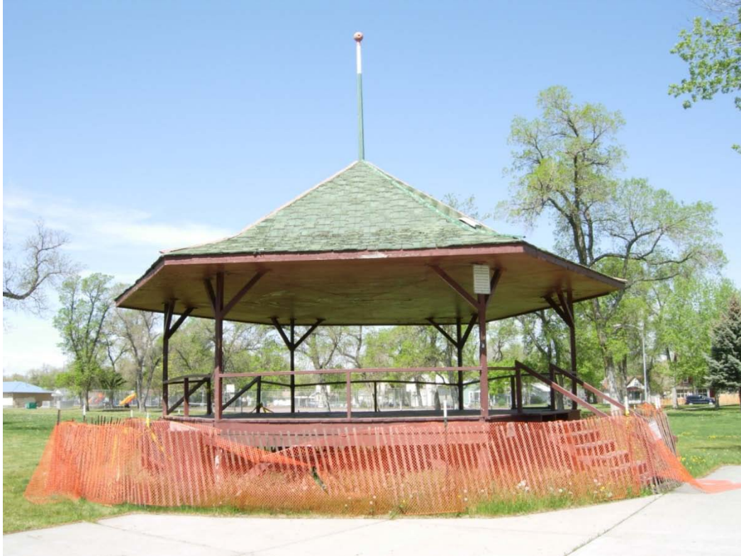
South Park gazebo