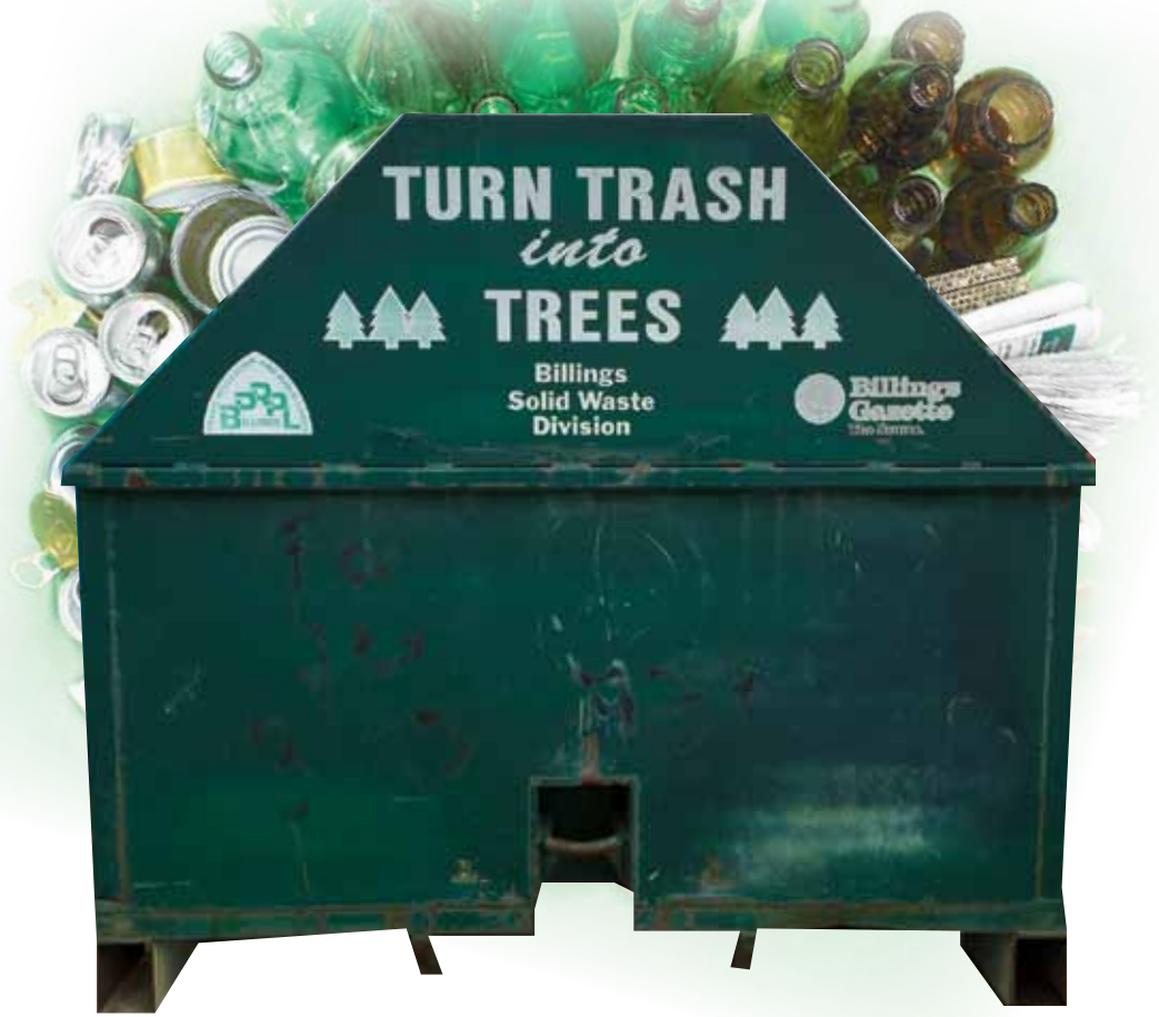
A “TURN-TRASH-INTO-TREES” BIN AS IT LOOKS TODAY AFTER 19 YEARS OF RUGGED USE. ALL BINS WILL BE GETTING A “FACELIFT” THIS SUMMER. KEEP A WATCH OUT FOR THEIR NEW LOOK!

For a recent article on EAB effects of EAB to urban forests please see: http://www.startribune.com/minneapolis-and-st-paul-are-losing-thousands-of-trees-to-emerald-ash-borer/421687683/ With planning, the EAB arrival to Billings can be as much of a non-event as Y2K was to Armageddon and all we have to do to make it so is turn our trash into trees.