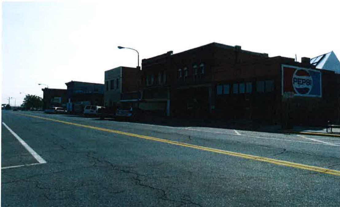
View of the South Side of the 2700 block of Minnesota