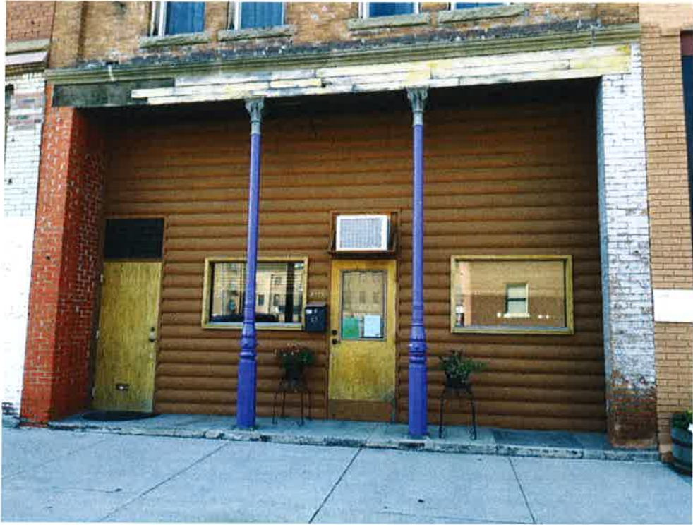
View facing front entry of building